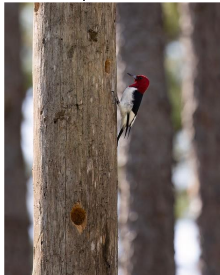
Redheaded Woodpecker