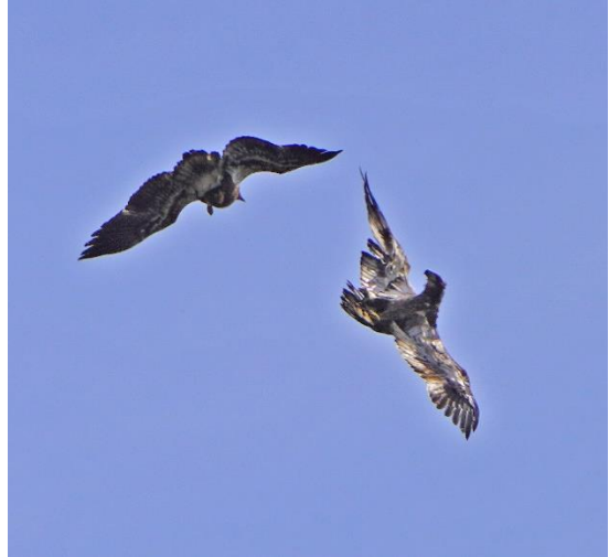
Acrobatic Juvenil Bald Eagles