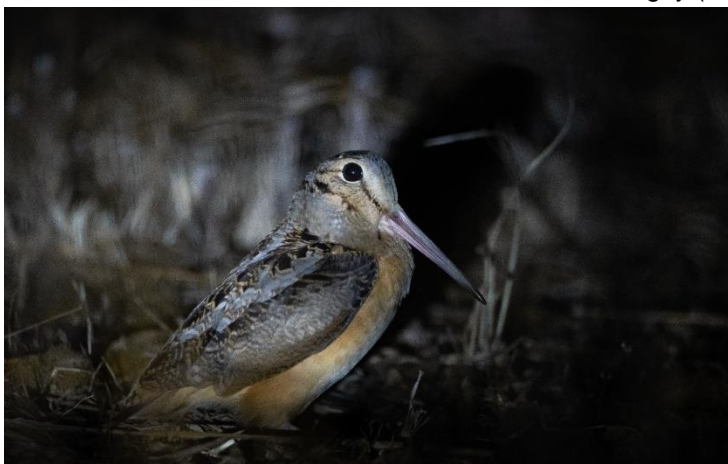
American Woodcock at Night